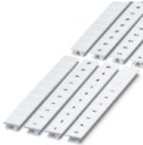
Zack marker strip, 10-section, horizontally labeled with the consecutive numbers: 31 ... 40, white

Please be informed that the data shown in this PDF Document is generated from our Online Catalog. Please find the complete data in the user's documentation. Our General Terms of Use for Downloads are valid ( http://phoenixcontact.com/download )